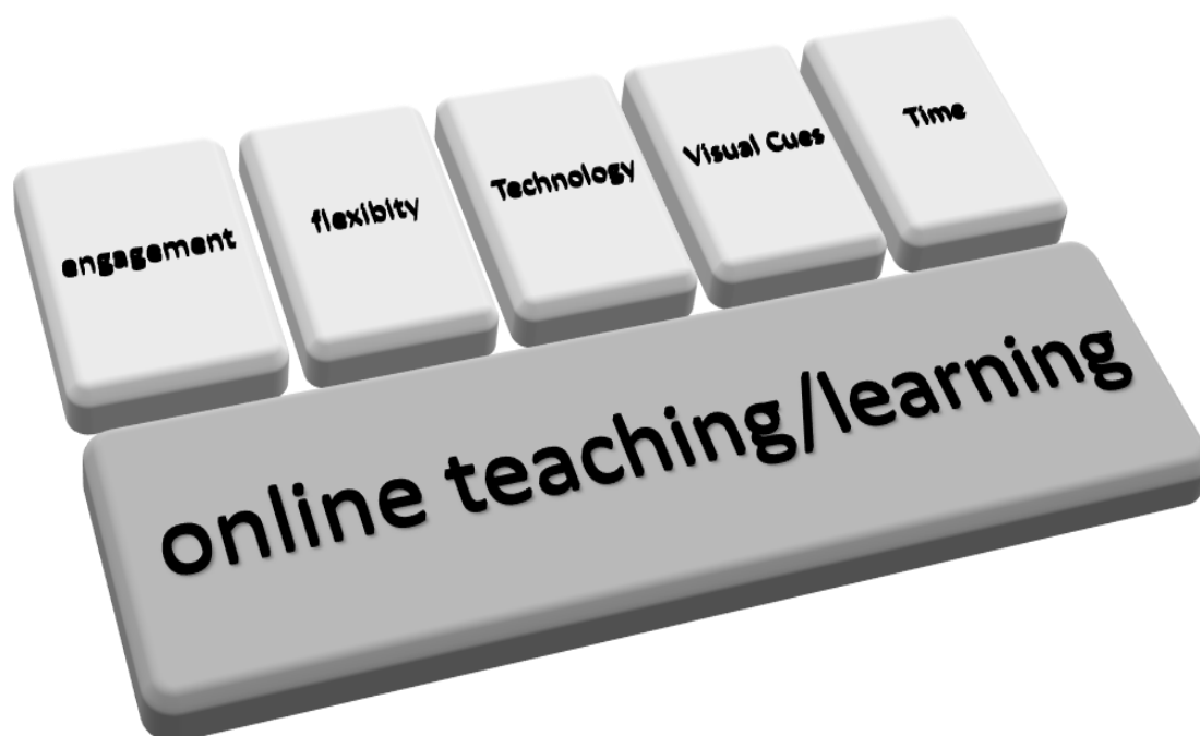
Figure 2: predominant themes in the study data